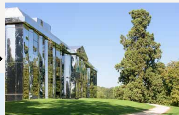
Parc culturel de Rentilly - Château - ©Valérie_AJAGP, 2014. © Marin Argyrogis